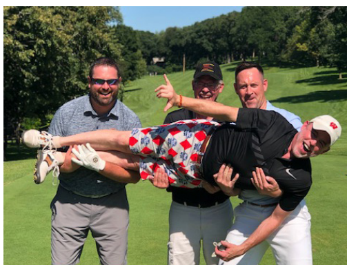
Jerry Brown and team