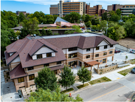
Located 2.5 miles from Unity Point Health – Meriter

Madison’s Ronald McDonald House provides families with a “home away from home” and the support they need while their child receives medical treatment.