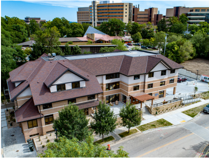
Located ~3 miles from SSM Health St. Mary's Hospital

Madison's Ronald McDonald House provides families with a "home away from home" and the support they need while their child receives medical treatment.